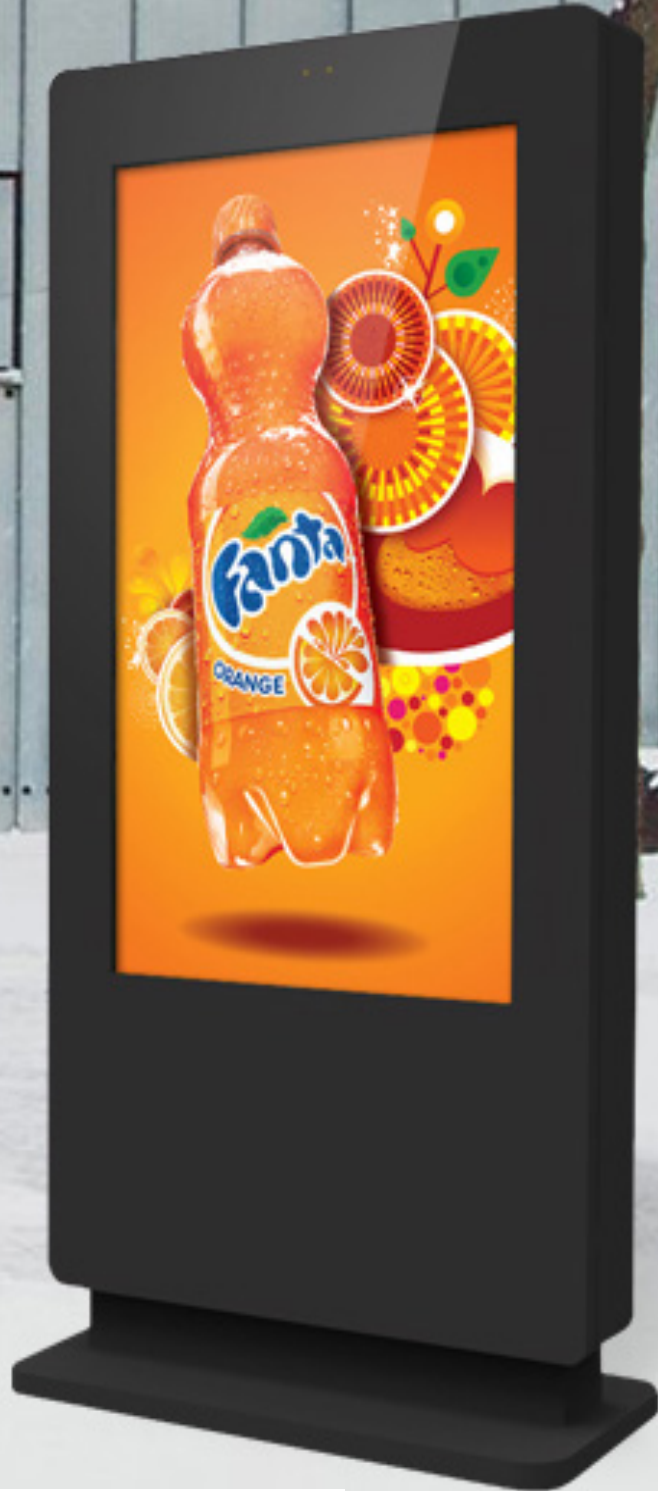
55" Outdoor Freestanding Digital Posters