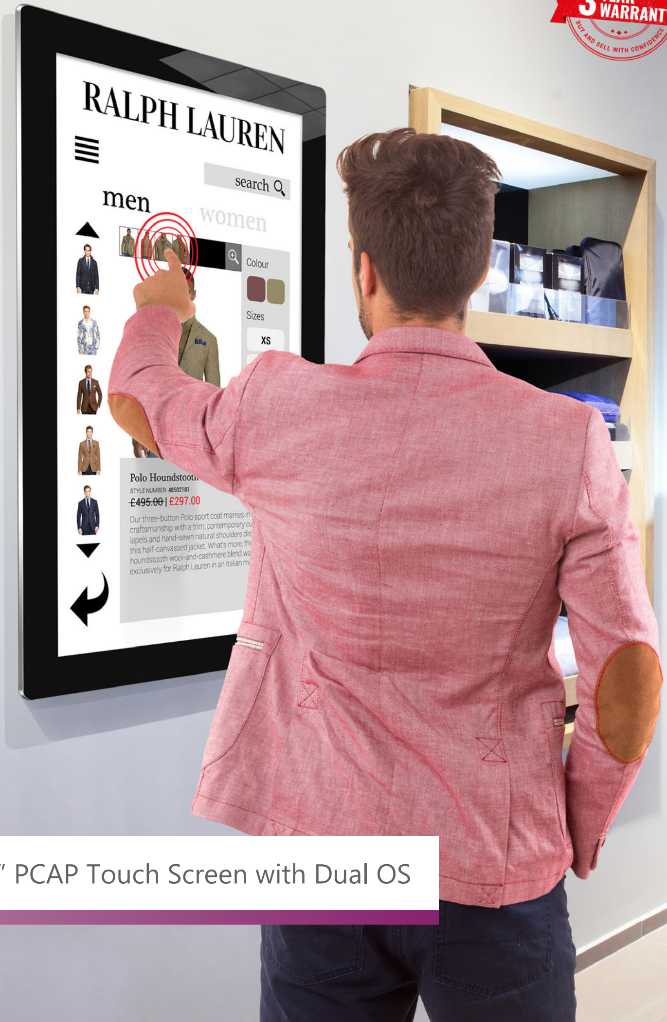
43" PCAP Touch Screen with Dual OS