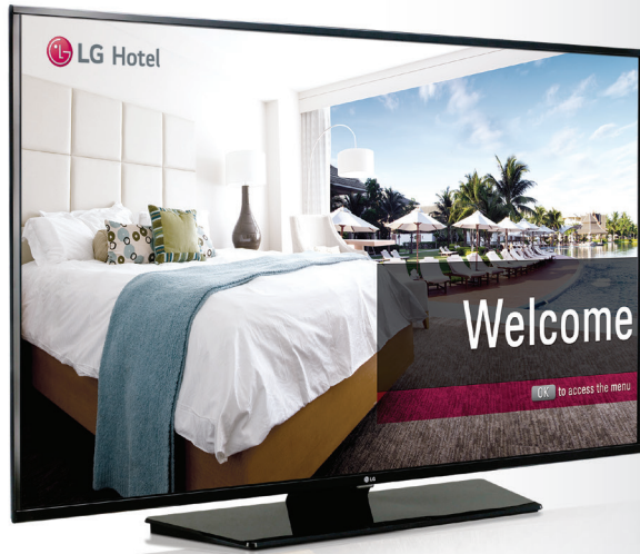
LX341C : 49" 55" 60"

LG Commercial Lite TVs are designed specifically for hospitality and business environments. With the use of simple user-friendly interfaces and superb images and video, the LX341C series create a more hospitable welcome for guests and customers.