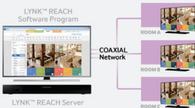
Figure 1. LYNK REACH solution diagram

LYNK™ REACH is designed exclusively to help hospitality businesses remotely, centrally and cost efficiently manage in-room displays. LYNK REACH is an server and software solution for hospitality environments that provides a simplified UI and editing tool. The software solution organizes and displays content, such as hotel information, images and logos and rich content including flight information, weather information and advertisement, using existing coaxial infrastructure. In addition, LYNK REACH improves usability by enabling hotel managers to edit channels and to monitor room status, recent deployment and activity. The solution also provides a simple, easy and intuitive user interface (UI) through Content Creator.