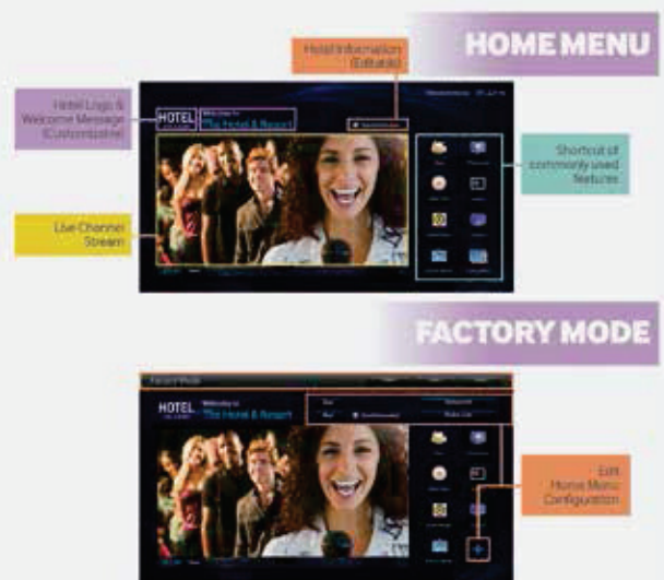
Figure 2. Enhanced Home Menu enables convenient delivery of useful information, while supporting hotel branding

The customizable Home Menu reduces the cost burden for hotels with consumer TVs that would otherwise have to adopt solution-embedded Hospitality TVs. With the Home Menu, these hotels can move forward from conventional consumer TVs to solution-based Hospitality TVs without incurring a huge expense.