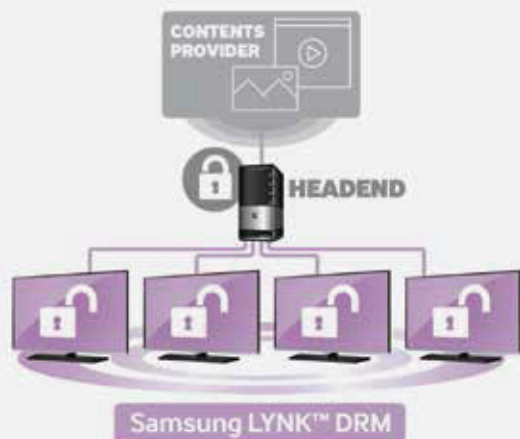
Figure 3. Enhanced content protection with LYNK DRM solution