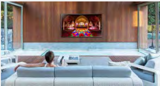
Figure 1. UHD Hospitality Displays upscale hotel atmosphere while delivering immersive viewing experience

With Samsung UHD TVs, premium and luxury hotel guests experience amazing picture quality and clarity, along with interactive enriched content that is tailored to make their stay memorable. Whether they're connecting wirelessly to a myriad of entertainment options or enjoying personal images and audio, guests' comfort and convenience are elevated to new levels. A remarkably immersive viewing experience through the HD890W SMART Hospitality Display curved screen provides guests with an unrivalled premium hotel stay. Meanwhile, hotel managers appreciate the efficiency of easy management and content differentiation provided by these superior UHD displays.