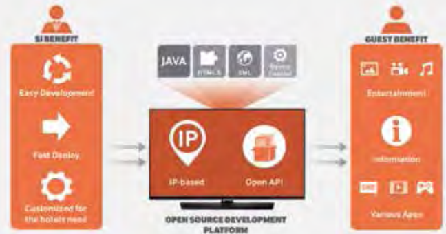
Figure 5. H.Browser diagram

and VoD content. Because H.Browser is based on Internet programming languages such as HTML5 and Java Script®, SIs can easily develop and quickly deploy robust, customized hotel solutions.