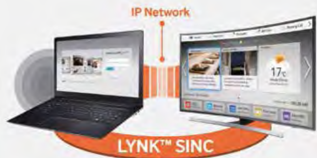
Figure 3. LYNK SINC solution diagram

The guest experience is enhanced with access to services and information, such as local event and tourist information, and available discounts. Useful hotel information such as room service or spa menus can be accessed through customizable widgets, as well as free, automatically updated weather information so guests can plan outdoor activities. LYNK SINC enables hotels to provide up-to-date flight information so guests can coordinate checkout times with flight departures and supports personalized, real-time guest messaging. All of these professional capabilities are provided simply over an IP network without the need for STBs, minimizing maintenance complexity and eliminating the cumbersome presence of STBs in the property's hotel rooms.