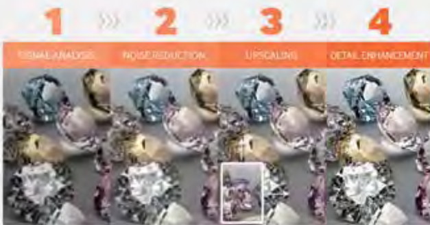
Figure 2. Viewers can enjoy UHD-like clarity through Upscaling Technology

Samsung UHD TVs deliver Full-HD (FHD) content with an embedded 4-step UHD Upscaling process to provide viewers with exceptionally detailed images and ultimate picture quality. Viewers enjoy consistent UHD-like clarity, even when they're watching content with FHD and lower resolution. UHD Dimming precisely scans an extraordinary number of zones across an entire image and adjusts brightness to deliver deeper darks and brighter whites. This feature virtually eliminates the "halo" effect and image distortion, so viewers enjoy a crystal-clear picture. Precision Black Local Dimming produces sharper contrast and darker black hues by dimming the LEDs behind the darkest area of the picture while leaving the brighter elements fully illuminated. With Wide Color Enhancer Plus, viewers witness a wider spectrum of colors on the TV screen, with enriched colors even for older, non-HD content.