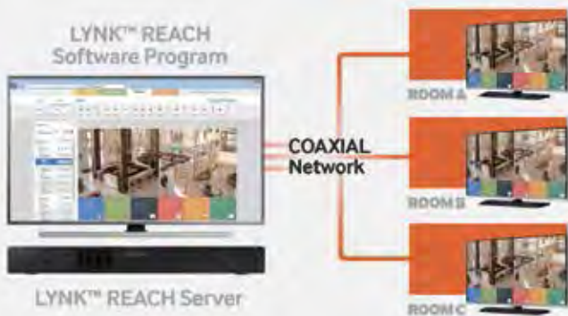
Figure 4. REACH solution diagram

Designed exclusively for hospitality businesses to help them manage content and control displays over current RF cables, LYNK™ REACH delivers remote, central and cost-efficient management of in-room displays. LYNK REACH is specialized software provided with LYNK REACH Server for hospitality environments. The software solution provides a simplified UI and editing tool that organizes and displays content, such as hotel information, images and logos, using existing infrastructures. LYNK REACH offers hoteliers advanced advertising functionalities and Channel Bank Management for Pay TV Services. In addition, LYNK REACH improves usability by enabling hotel managers to monitor room status, recent deployment and activity and with a simple, easy and intuitive user interface (UI) through Project Creator.