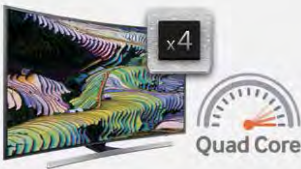
Figure 6. Quad Core enables powerful TV performance

A software-only implementation, LYNK DRM technology reduces the need for additional equipment and provides quicker recovery for Conditional Access System (CAS) problems. To help ensure reliability of the system, coverage extends to the enlargement of head-end equipment for cable operators.