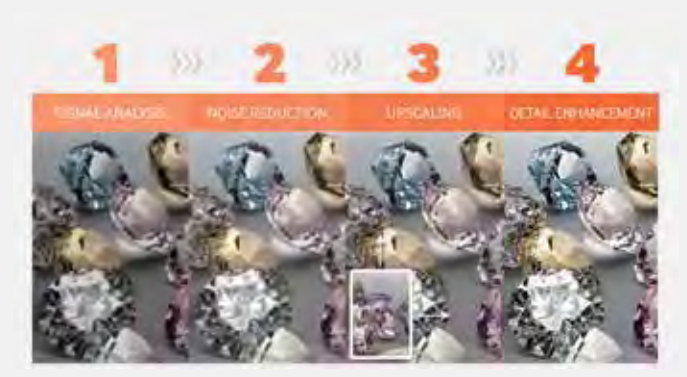
Figure 2. Viewers can enjoy UHD-like clarity through Upscaling Technology

Samsung UHD TVs deliver Full-HD (FHD) content with an embedded 4-step UHD Upscaling process to provide viewers with exceptionally detailed images and ultimate picture quality. Viewers enjoy consistent UHD-like clarity, even when they're watching content with FHD and lower resolution. UHD Dimming precisely scans an extraordinary number of zones across an entire image and adjusts brightness to deliver deeper darks and brighter whites. This feature virtually eliminates the "halo" effect and image distortion, so viewers enjoy a crystal-clear picture. Precision Black Local Dimming produces sharper contrast and darker black hues by dimming the LEDs behind the darkest area of the picture while leaving the brighter elements fully illuminated. With Wide Color Enhancer Plus, viewers witness a wider spectrum of colors on the TV screen, with enriched colors even for older, non-HD content.