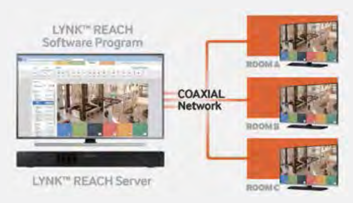
Figure 4. REACH solution diagram

Designed exclusively for hospitality businesses to help them manage content and control displays over current RF cables, LYNK<sup>TM</sup> REACH delivers remote, central and cost-efficient management of in-room displays. LYNK REACH is specialized software provided with LYNK REACH Server for hospitality environments. The software solution provides a simplified UI and editing tool that organizes and displays content, such as hotel information, images and logos, using existing infrastructures. LYNK REACH offers hoteliers advanced advertising functionalities and Channel Bank Management for Pay TV Services. In addition, LYNK REACH improves usability by enabling hotel managers to monitor room status, recent deployment and activity and with a simple, easy and intuitive user interface (UI) through Project Creator.