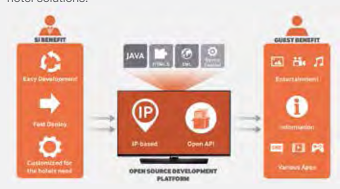
Figure 5. H.Browser diagram

and VoD content. Because H.Browser is based on Internet programming languages such as HTML5 and Java Script®, SIs can easily develop and quickly deploy robust, customized hotel solutions.