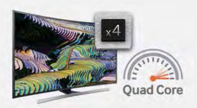
Figure 6. Quad Core enables powerful TV performance

Soft AP provides a software access point (AP) or hotspot. Up to four devices can connect wirelessly to the AP. Hotel managers can change the signal level and channel of the Soft