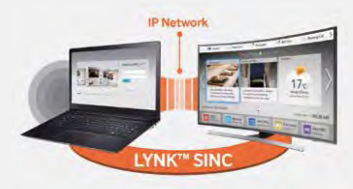
Figure 3. LYNK SINC solution diagram

The guest experience is enhanced with access to services and information, such as local event and tourist information, and available discounts. Useful hotel information such as room service or spa menus can be accessed through customizable widgets, as well as free, automatically updated weather information so guests can plan outdoor activities. LYNK SINC enables hotels to provide up-to-date flight information so guests can coordinate checkout times with flight departures and supports personalized, real-time guest messaging. All of these professional capabilities are provided simply over an IP network without the need for STBs, minimizing maintenance complexity and eliminating the cumbersome presence of STBs in the property's hotel rooms.