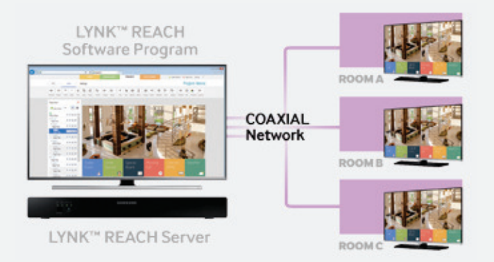
Figure 1. LYNK REACH solution diagram

LYNK<sup>™</sup> REACH is designed exclusively to help hospitality businesses remotely, centrally and cost efficiently manage in-room displays. LYNK REACH is an server and software solution for hospitality environments that provides a simplified UI and editing tool. The software solution organizes and displays content, such as hotel information, images and logos and rich content including flight information, weather information and advertisement, using existing coaxial infrastructure. In addition, LYNK REACH improves usability by enabling hotel managers to edit channels and to monitor room status, recent deployment and activity. The solution also provides a simple, easy and intuitive user interface (UI) through Content Creator.