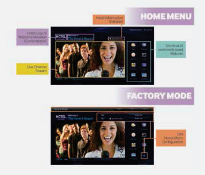
Figure 2. Enhanced Home Menu enables convenient delivery of useful information, while supporting hotel branding

The customizable Home Menu reduces the cost burden for hotels with consumer TVs that would otherwise have to adopt solution-embedded Hospitality TVs. With the Home Menu, these hotels can move forward from conventional consumer TVs to solution-based Hospitality TVs without incurring a huge expense.